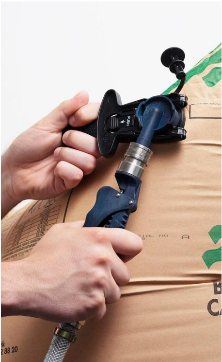
Inflation with Quick inflator