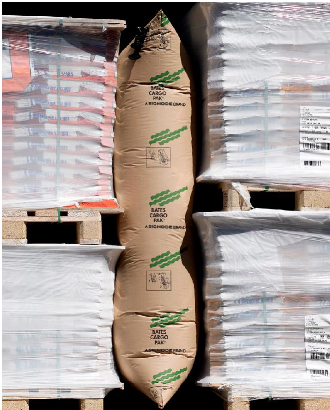
Reuse airbag inflated in position