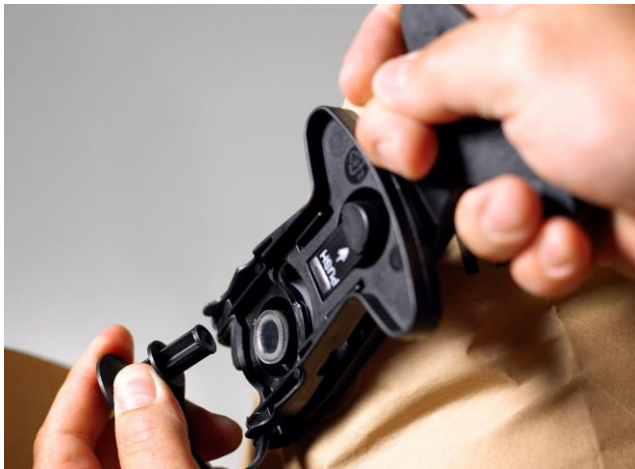
Reusable valve system