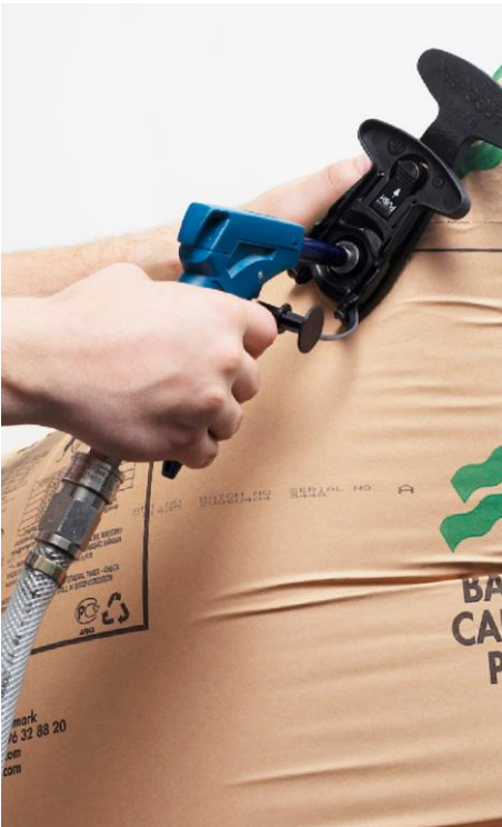
Inflation with Standard Inflator