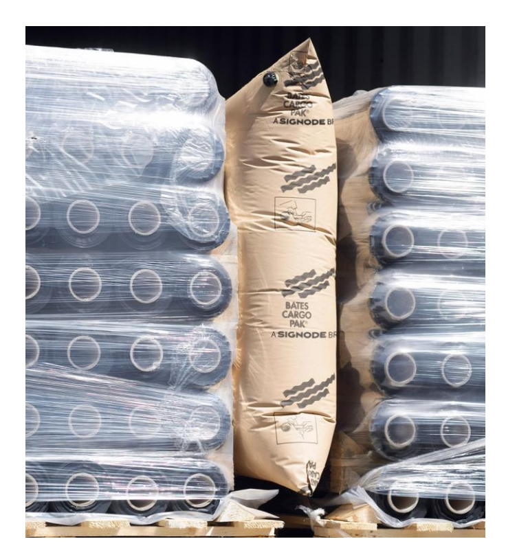
Flex Eco inflated in position