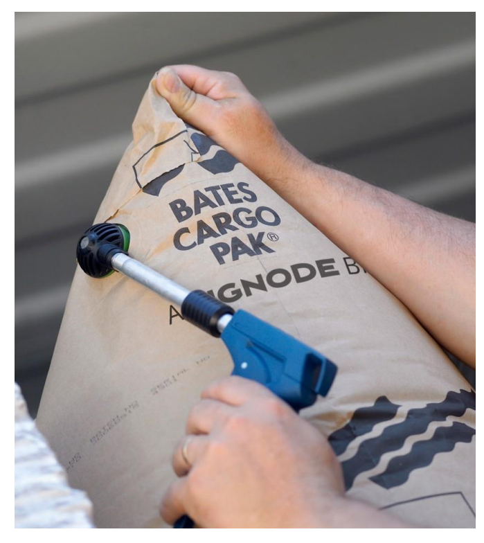
Inflation with Flex Inflator