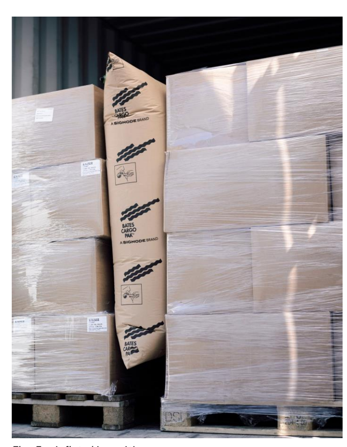
Flex Eco inflated in position