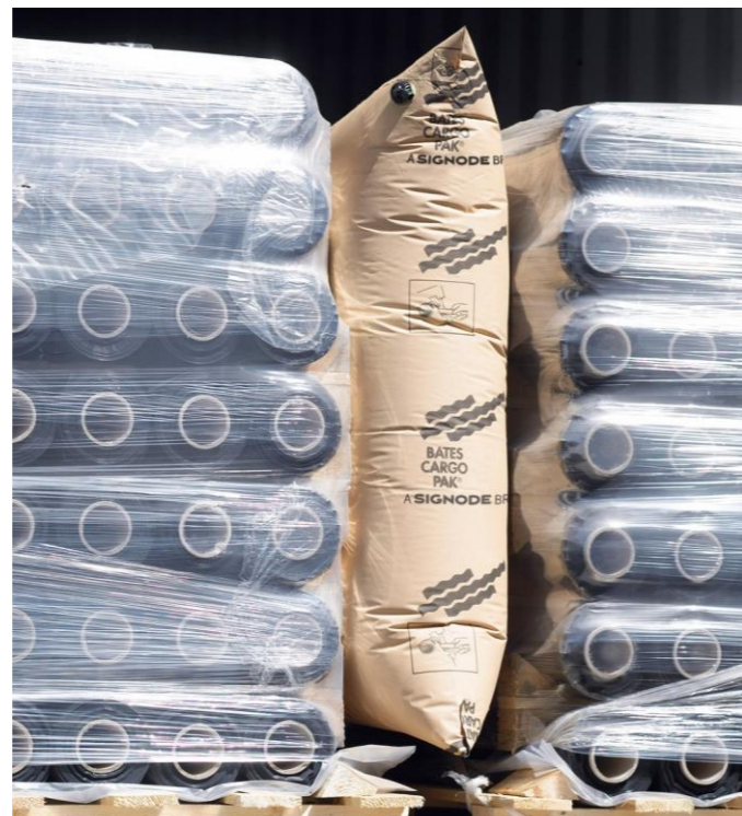
Flex Eco inflated in position