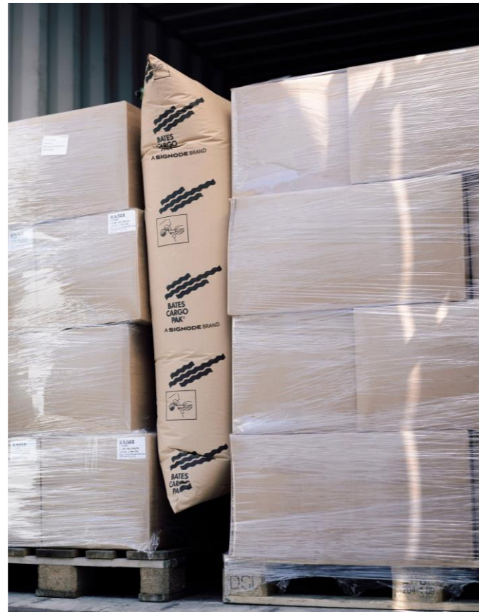
Flex Eco inflated in position

Entirely made from environmentally friendly materials. High wet strength due to the choice of materials and composition. Can withstand up to 90% relative humidity (RH) at 60°C.