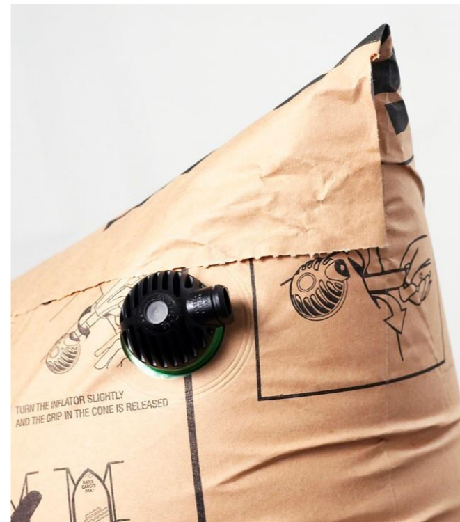
Flex Eco valve

The airbag is deflated by puncturing it in one corner with a sharp object. It can then be removed immediately.